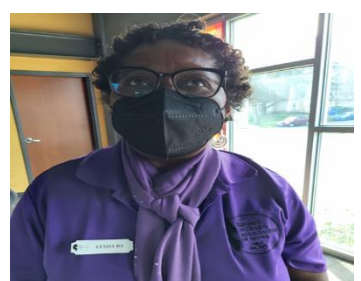
Chapter Goal in Action: Linking the Community to a Brighter Future